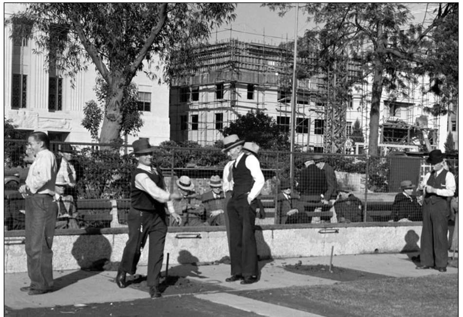
Several men, most wearing hats, can be seen pitching horseshoes at the public horseshoe court in Lincoln Park, Long Beach. Several others sit on long benches behind the fence. Across the street, in the background, a building is surrounded by scaffolding.